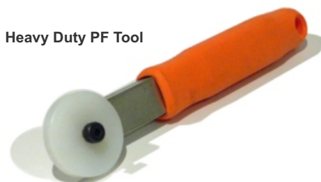
Heavy Duty PF Tool